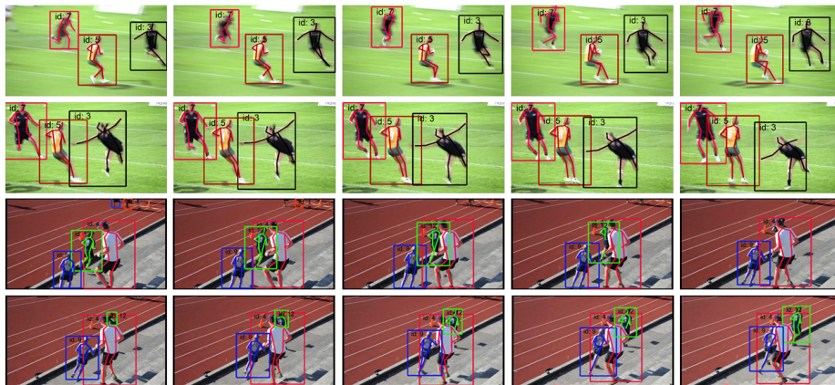
Fig. 3. Some sample results on PoseTrack Challenge test set.

uates pose estimation but allows usage of temporal information across frames. Task 3 evaluates tracking using multi-object tracking metrics [4]. As our tracking baseline uses temporal information, we report results on Task 2 and 3. Note that our pose estimation baseline also performs best on Task 1 but is not reported here for simplicity.